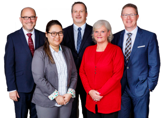
The Beirnes Wealth Management Group BMO Nesbitt Burns

1. As a % of GDP; 2. Rule of 72: It takes approx. 72 \div (\text{rate of return}) years for investment to double; 3. Based on shares of Berkshire Hathaway (BRK-A). 8/30/95: $25,300; 10/30/20: $302,500.