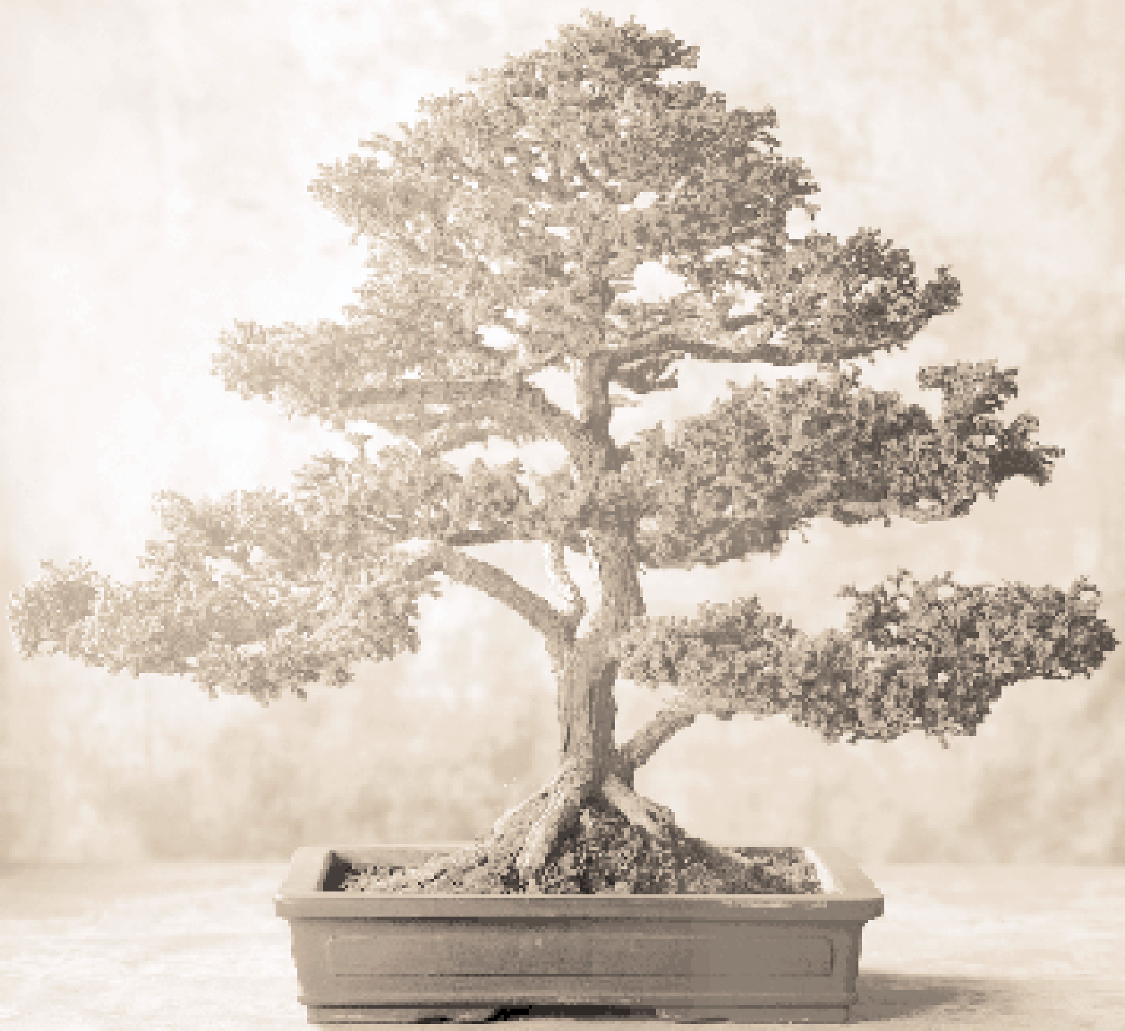
CHAMAECYPARIS PISIFERA PLUMOSA COMPRESSA - SAWARA FALSE CYPRESS - 20 YEARS