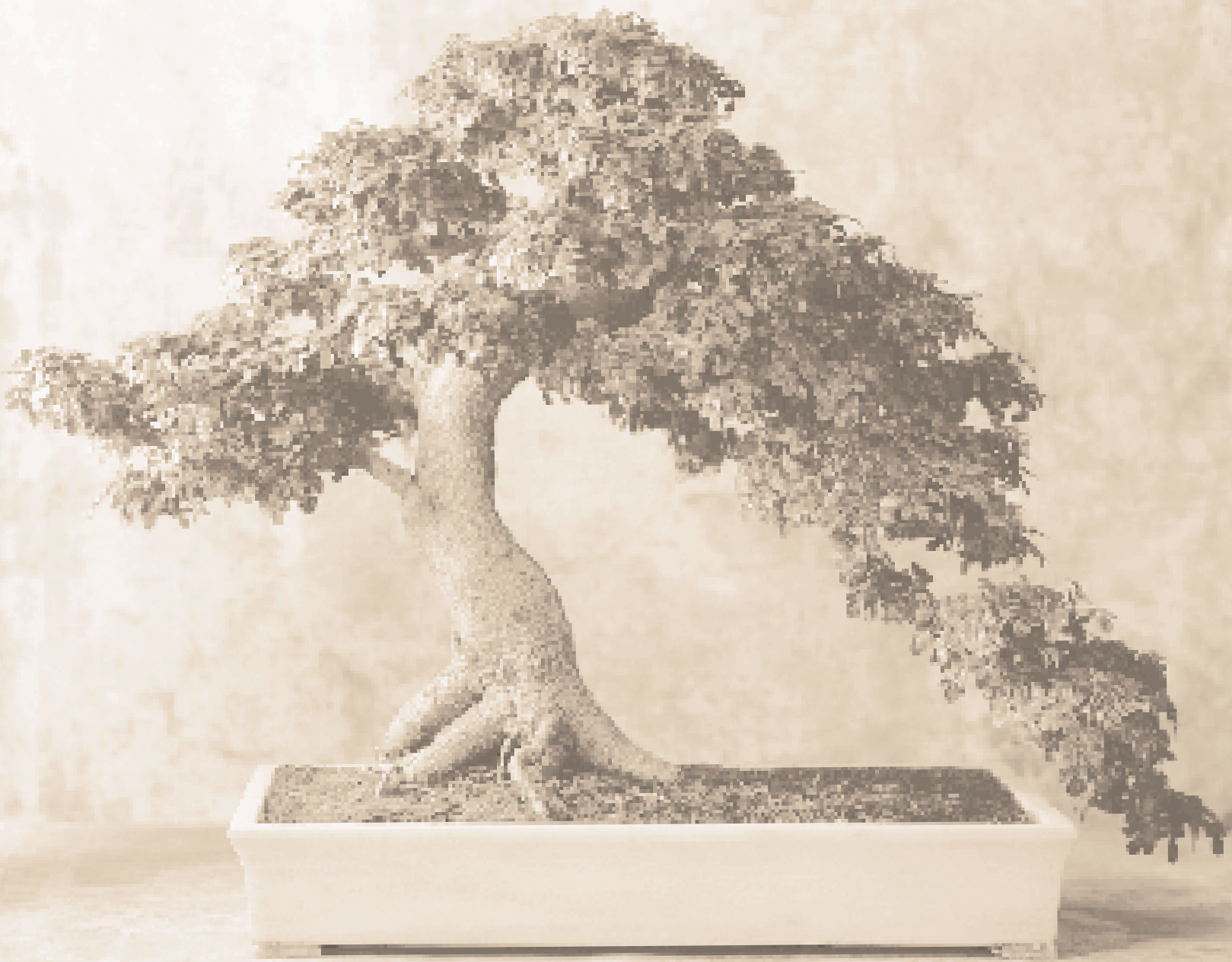
LIMONIA ACIDISSIMA - ELEPHANT APPLE - 42 YEARS