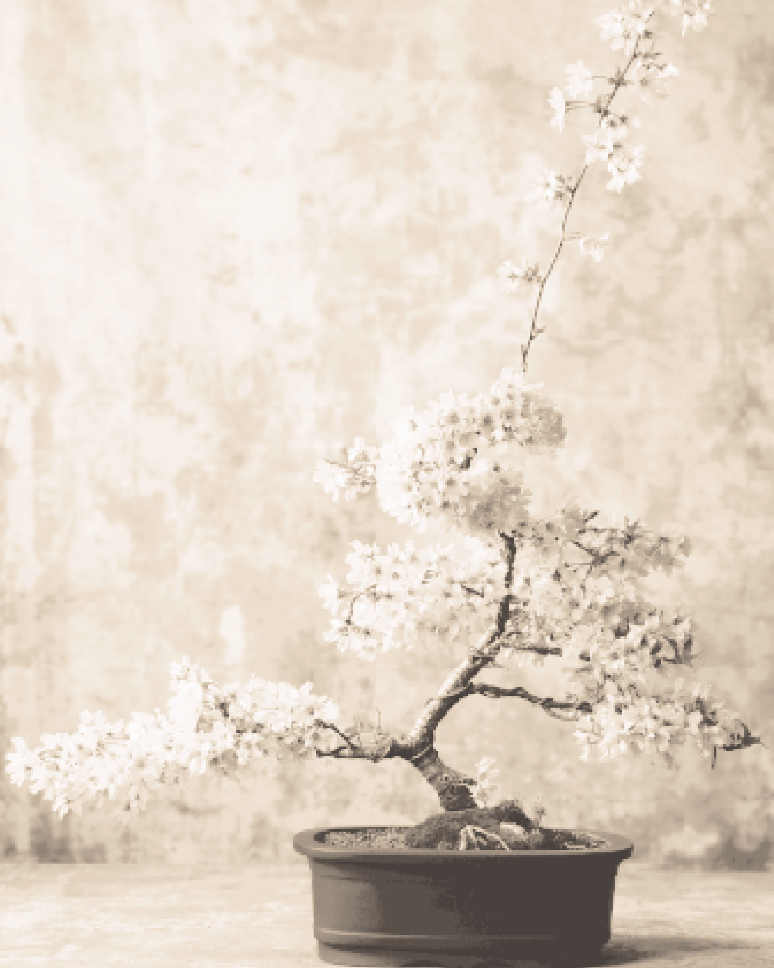
PRUNUS NIPPONICA BAR. KURILENSIS - JAPANESE FLOWERING CHERRY - 10 YEARS