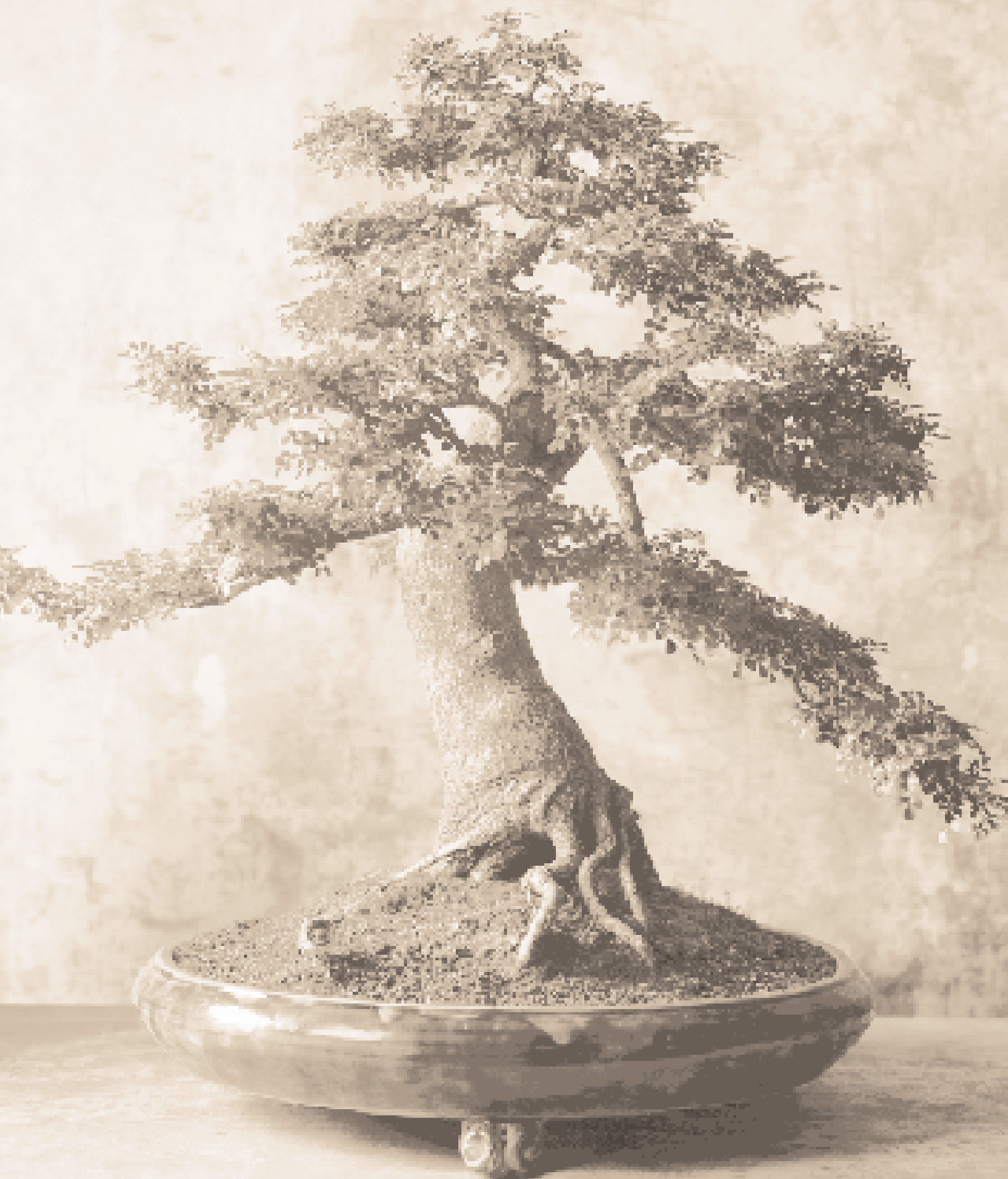
LIMONIA ACIDISSIMA - ELEPHANT APPLE - 45 YEARS