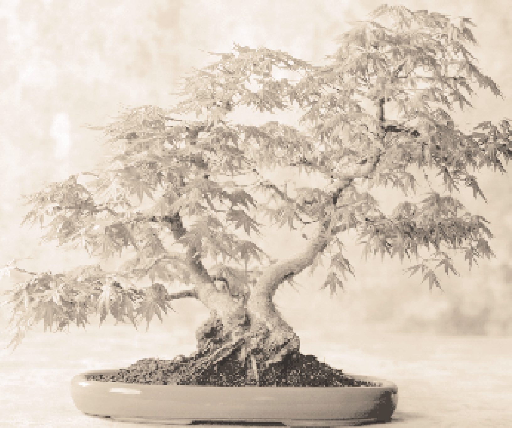
ACER PALMATUM SSP. MATSUMURAL - JAPANESE MAPLE - 30 YEARS