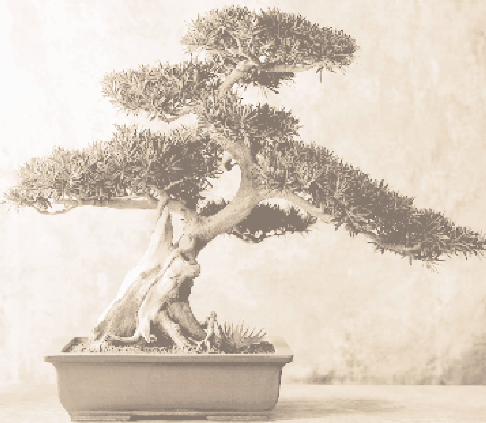
PODOCARPUS MACROPHYLLUS "MAKI" - CHINESE PODOCARPUS - 155 YEARS