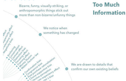
Chart: An Excerpt from the Cognitive Bias Codex