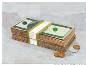
ILLUSTRATION: WARREN BUFFETT

Over the past century these instruments have destroyed the purchasing power of investors in many countries , even as these holders continued to receive timely payments of interest and principal. This ugly result, moreover, will forever recur. Governments determine the ultimate value of money, and systemic forces will sometimes cause them to gravitate to policies that produce inflation. From time to time such policies spin out of control.