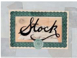
ILLUSTRATION: SHARON BOOTH

My own preference -- and you knew this was coming -- is our third category: investment in productive assets, whether businesses, farms, or real estate. Ideally, these assets should have the ability in inflationary times to deliver output that will retain its purchasing-power value while requiring a minimum of new capital investment. Farms, real estate, and many businesses such as Coca-Cola ( KO ), IBM ( IBM ), and our own See's Candy meet that double-barreled test. Certain other companies -- think of our regulated utilities, for example -- fail it because inflation places heavy capital requirements on them. To earn more, their owners must invest more. Even so, these investments will remain superior to nonproductive or currency-based assets.