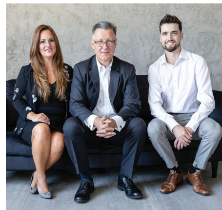
Weedon-Kubay Investment Group of BMO Nesbitt Burns

Surviving in Challenging Economic Times ... 3 Start Thinking About Your 2023 Tax Position ... 4