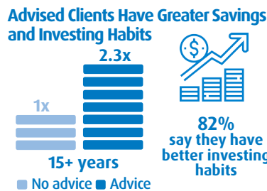
https://cirano.qc.ca/files/publications/2020RP-04.pdf ; Pollara Research Strategic Insights 2020

Staying on track — In challenging market times, we are here to help navigate uncertainties and stay focused on your longer-term goals. This includes providing behavioral coaching and ensuring you have a solid financial plan in place. A study of nearly 120,000 U.S. investors found that a well-structured plan can be key to staying the course. During the 2020 pandemic, when the U.S. stock market fell 34 percent in just 22 days, over three-quarters of investors who were previously on track with their financial goals remained on target, even though their portfolios typically declined by 16 percent (and, for those who held on, quickly recovered). 3