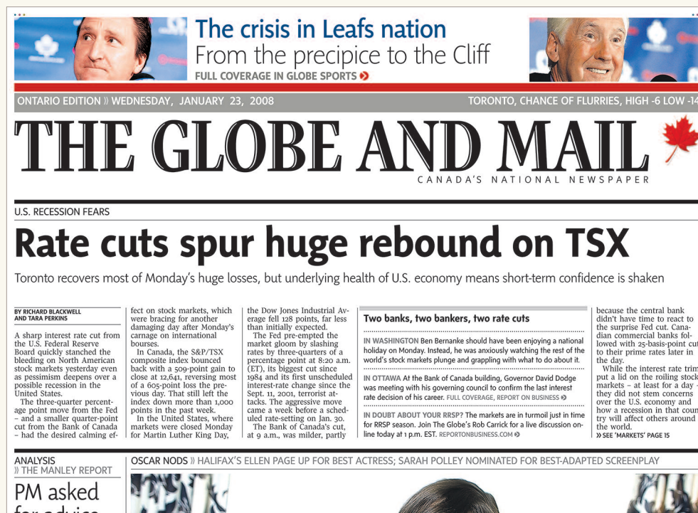
Source: The Globe and Mail, January 23, 2008

"Bull markets are born on pessimism, grow on skepticism, mature on optimism and die on euphoria." – Sir John Templeton